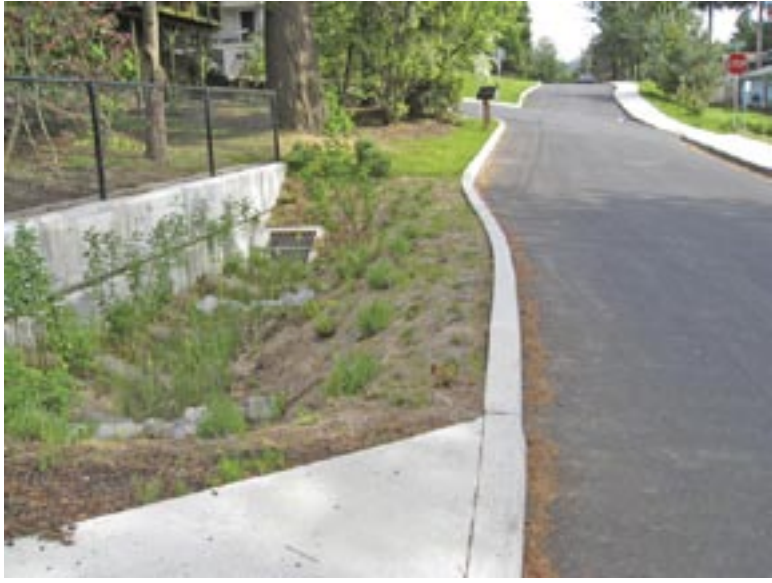
Rain falling on the street flows into bioswales. Rocks & native plants slow down fast-moving stormwater and reduce basement flooding.

by Jen Seamans Blatner, Watershed Resource Center