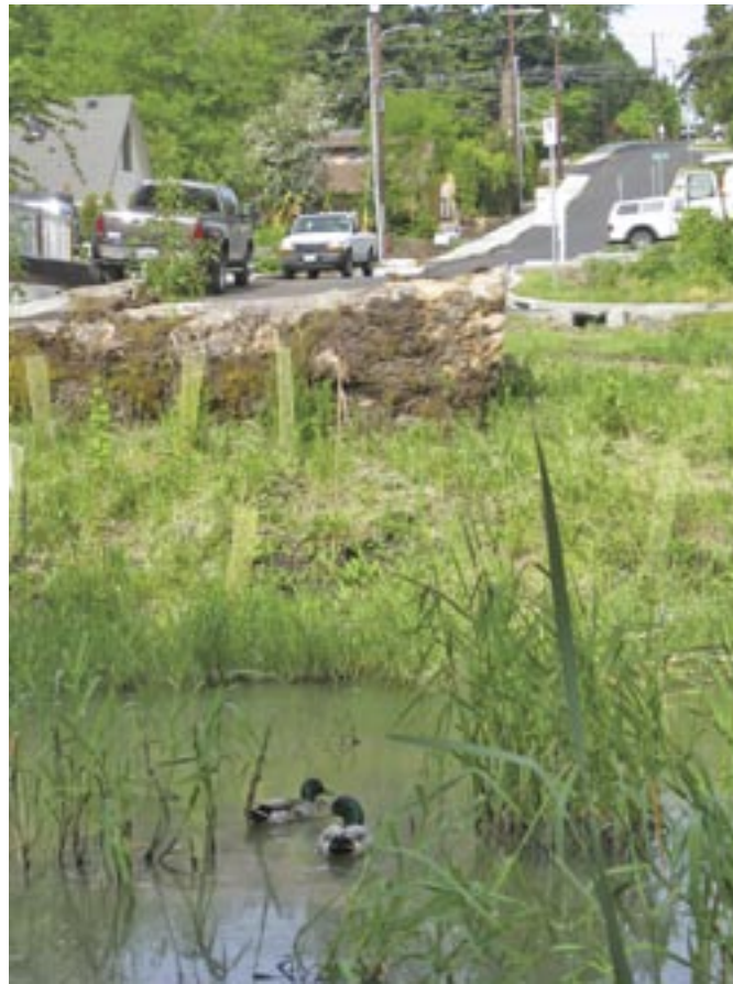
Mallards and people enjoy the new pond receiving stormwater from the Texas Green Street. Water is filtered by plants and stored in the wetland.

To learn about other projects in the Stephens Creek watershed, contact the Watershed Center at 503-823-2862 or watershed@spiritone.com.