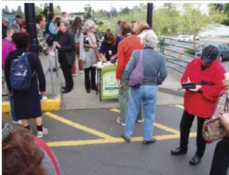
Neighbors who attended the May 12 ceremony announcing that Food Front's coming to Hillsdale took the opportunity to become owner/members in the customer cooperative. Food Front/Hillsdale will open in the late summer. The community has been without a store in the Town Center since last October.